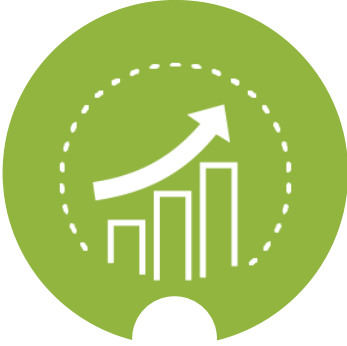
Continued rate pressures